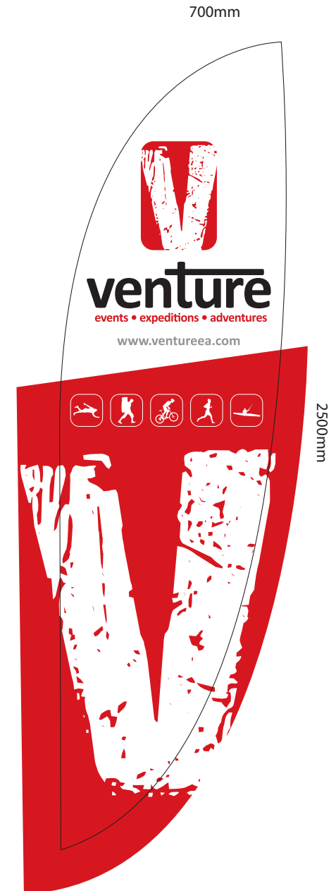
Example 2: Print-Ready file

(The pocket is 70mm. Therefore, 140mm bleed on top & 50mm on the remaining sides is added from my end)